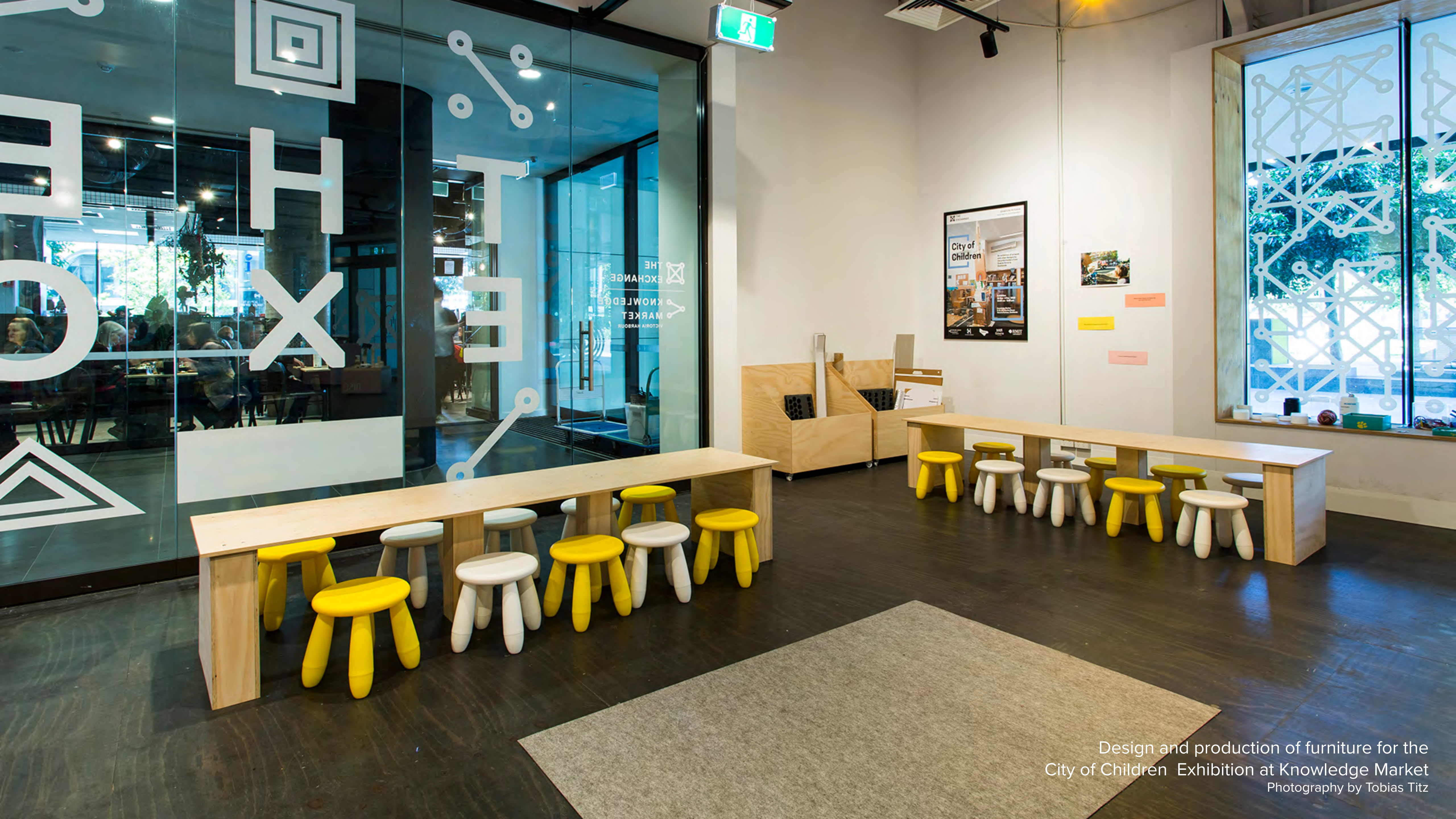
Design and production of furniture for the City of Children Exhibition at Knowledge Market