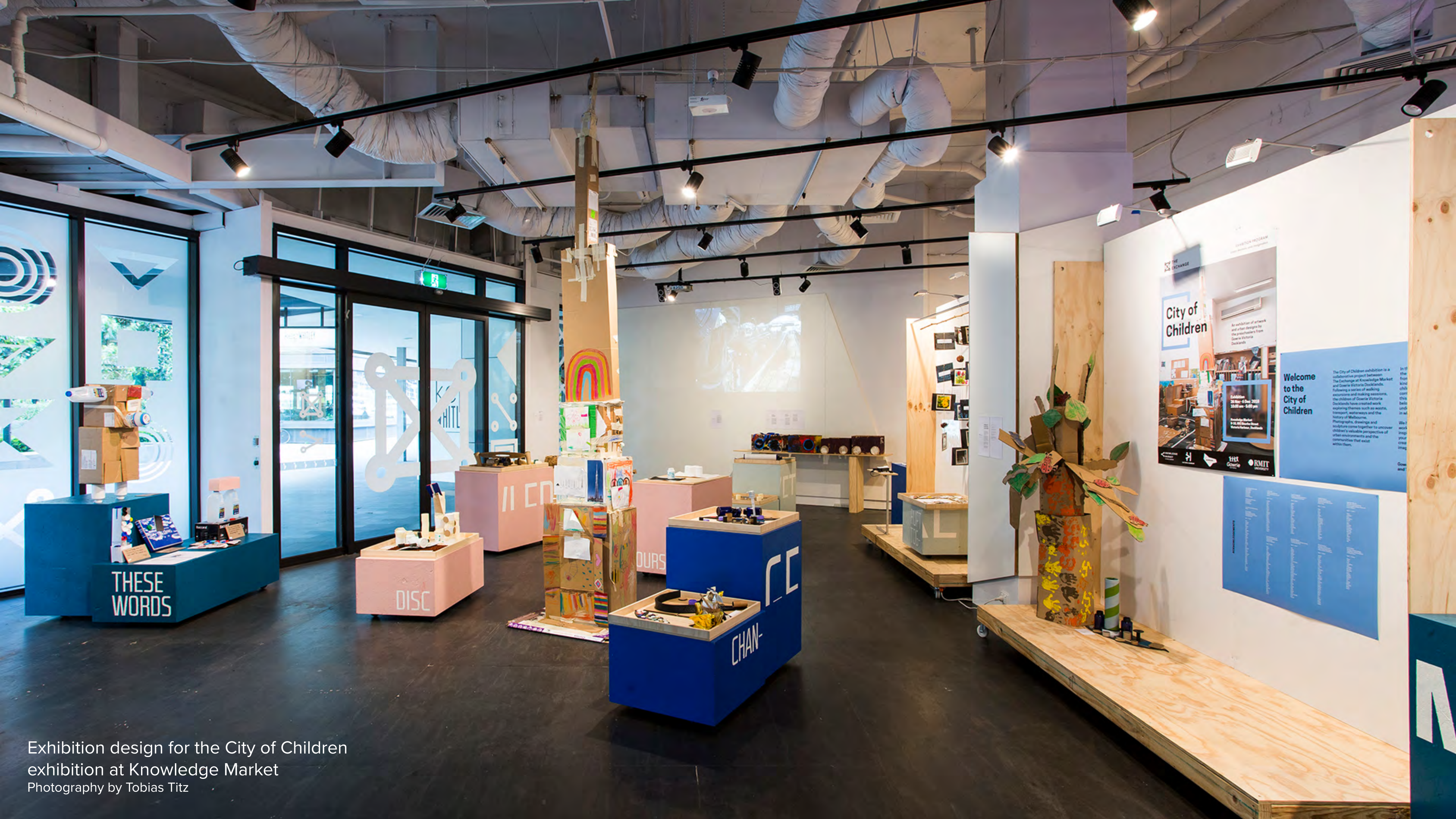
Exhibition design for the City of Children exhibition at Knowledge Market